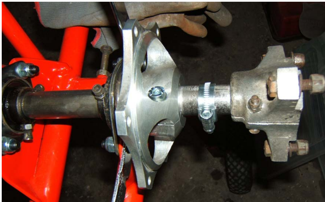
The new, old design sprocket carrier, and hub that would move no matter how much I tightened it, I got brand new old design hubs from Dartford karting.

However I was to find much later that there was another problem with the brake, it would not release, it needed a stronger return spring, not only on the brake arm but also on the cable.