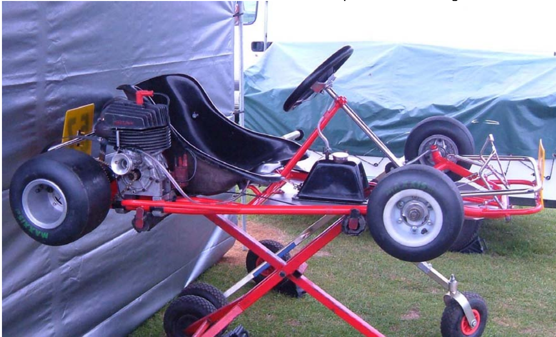
The "57" at Strubby, April the 24 th 2010, three and a half months after buying the kart and about to turn a wheel for the first time in over 30 years.