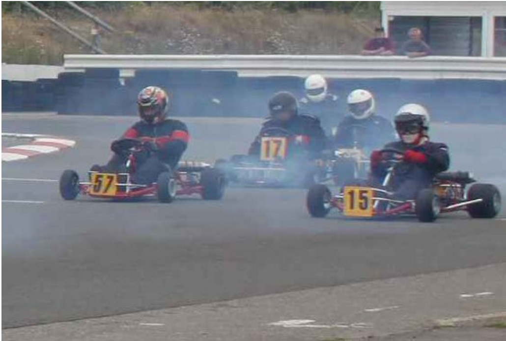
First Race Retro event at Llandow, July 4 th , note the narrow Vintage Speed Tyres, which replicate the period correct Goodyear Bluestreak's.