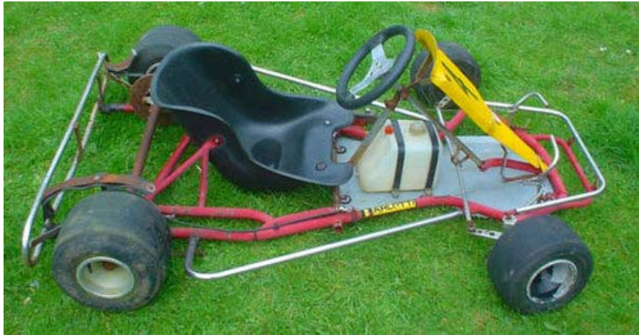
The last Barlotti?